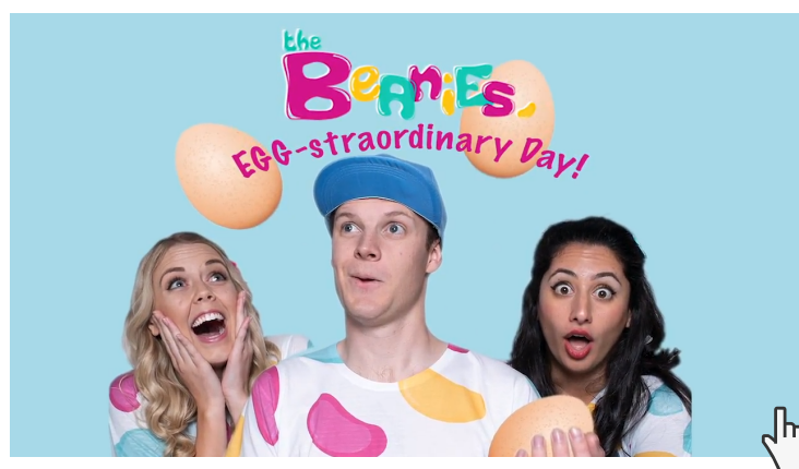
The Beanies' Egg-straordinary Day Musical (promo) - Composer

Click on the tiles & logos to open the content in a new window!