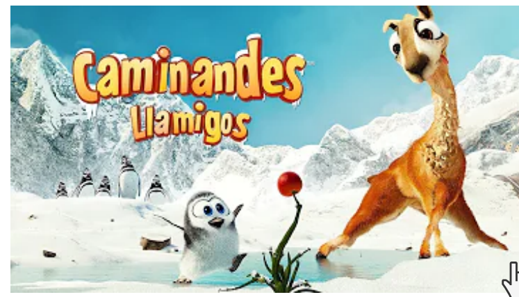
Caminandes - Llamigos (Re-score)