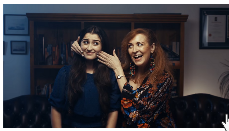
Therapy: The Musical Short film - Composer