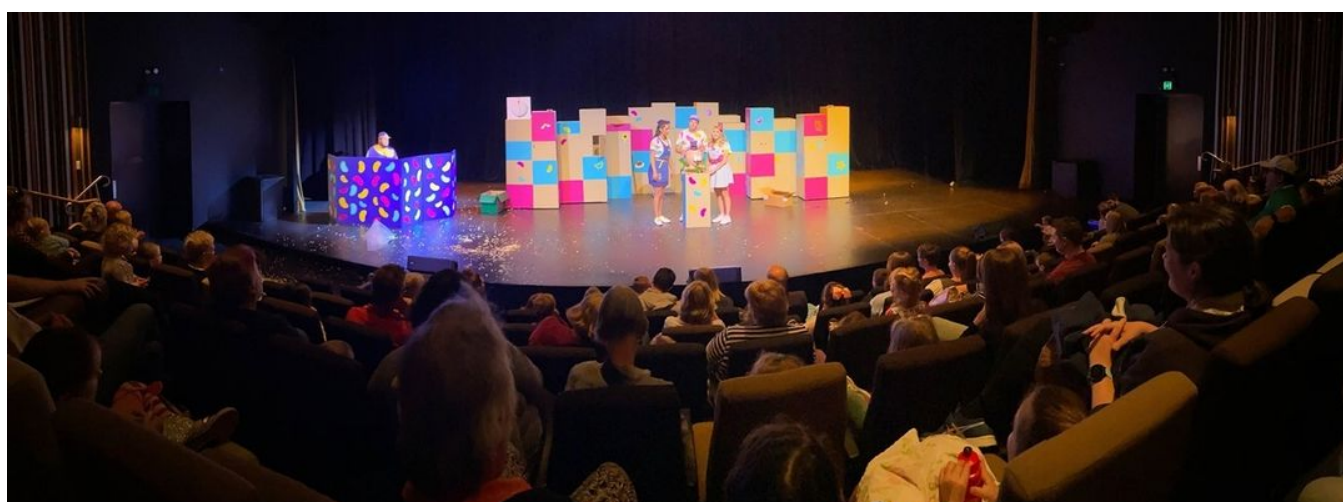
Onstage during a performance of The Beanies' Egg-straordinary Day