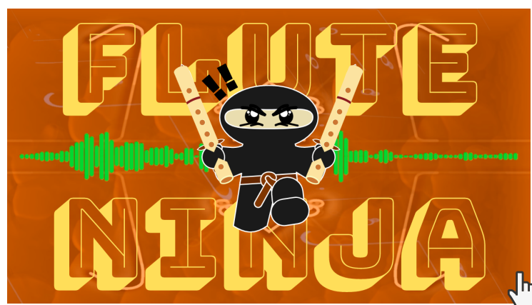
Flute Ninja Original instrumental